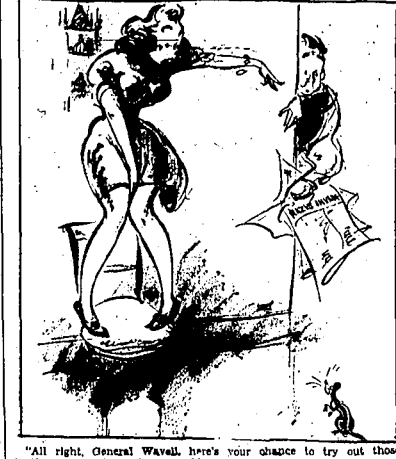
"All right, General Wavell, here's your chance to try out those tactics you've said England should use in case of invasion!"