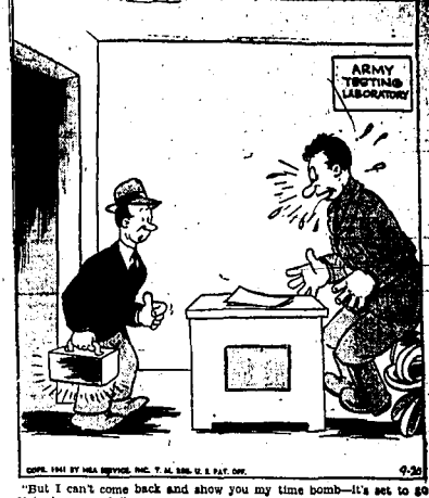
"But I can't come back and show you my time bomb—it's set to go off in ten seconds."

REDEYER NO BUT HORSON WAS UP THERE! YOU SEE 'EM KILLER BEAR RED RYDER! COUSINS WREATHENED TO RUN US SHEEP RANCHERS OUT OF OUR BEST PASTURE HILLS. YES, AND I WARNED HIM AGAINST WAITING A FIGHT! WHAT WE DO IN ABOUT KILLIN' A BEAR, RED RYDER? WE'RE BUILDING A TRAP—RIGHT NOW!