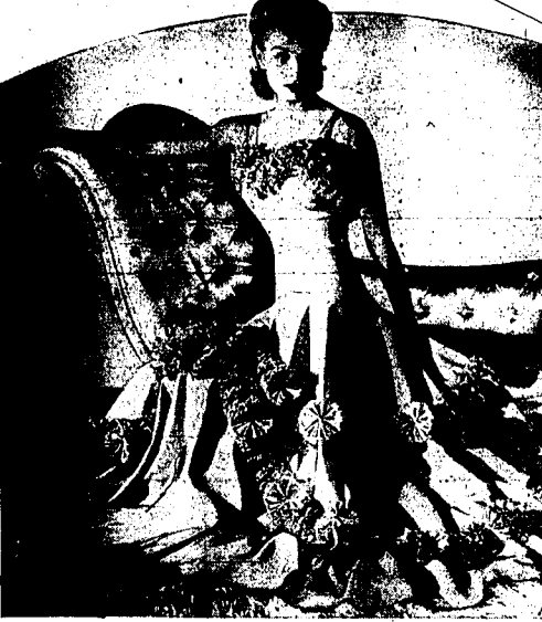
Rayon comes forward this year in luxury clothes, as budget items. Typical of the trend is the gown shown above. Deep bands of self-ruffling garland the sweeping skirt and tiny long-stemmed bodice. The heart-shaped décolletage has simple self-ruffing shoulder straps. This fabric is rayon faller.