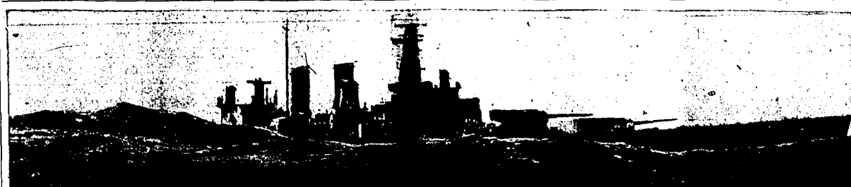
NAVY DAY, 1941—U. S. S. North Carolina Leads History's Mightiest Fleet