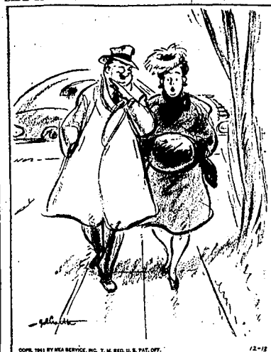
When Jones suggests table tennis, you sure and can't mention it. I've bought a set and practiced every night for three weeks!