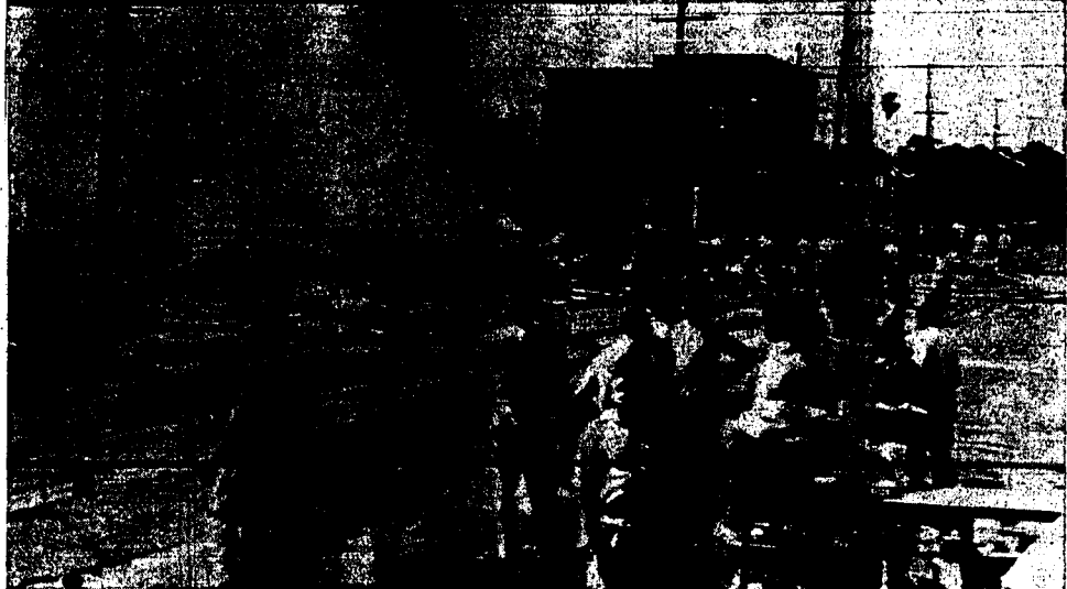
Here is a scene in Honolulu, taken by Allan C. Campbell, Acme News-pictures staff cameraman, on the job showing damage in the city from Japanese bombs, first photo of the attack. A drugstore at King and McCully streets was fired by incendiary bombs, and spread flames to the surrounding area. Citizens work to stop the blaze. (Passed by U. S. Censor)