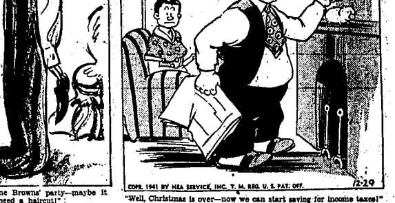
"Well, Christmas is over—now we can start saving for income taxes!"

CHICAGO, Dec. 22 (UP)—Dullness characterized trading in grain but prices closed with small gains.