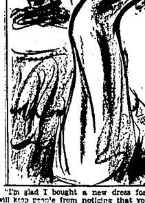
"I'm glad I bought a new dress for the Brown party—maybe it will keep people from noticing that you need a haircut!"