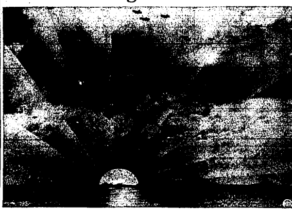
Mystery shrouds the number and strength of the ships and planes that fight under the baleful rays of the Rising Sun symbol.