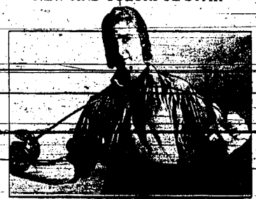
A new star to screen fans is Errol Flynn who plays the title role in the spectacular screen production of Rafael Sabatini's great adventure story, "Captain Blood." It opens an engagement at the Orpheum tomorrow with the current engagement of Kay Francis.