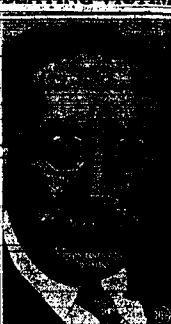
Leon Blum (above), Socialist leader of the chamber of deputies, was dragged from his cell and severely beaten in Paris by a group believed to represent the royalists, whom he has opposed. To appease Blum's followers Premier Sarraut issued a decree of dissolution against the military royalist organization.