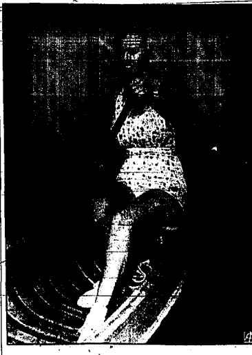
VACATIONING at Lake Arrowhead, Calif., Margaret Lindsay tries paddling her own canoe.