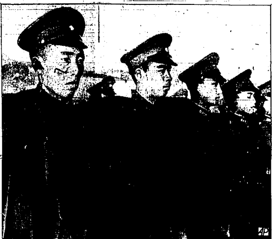
CHIANG'S PRIDE: Flow of the troops of Nanking central government are these. General Chiang's own guards. Trained by foreign military experts they constitute China's greatest defense. Chiang has been credited with a policy of meeting Japanese threats with diplomacy in order to prepare his war machine. Now he's sending troops and planes to Peiping.