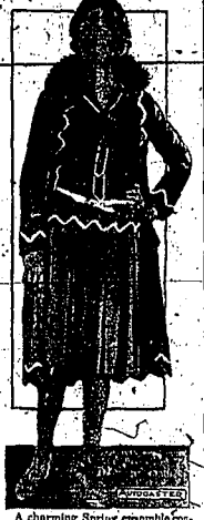
A charming Spring ensemble costume for wear now and later. Foulid to the last degree, it is equally as becoming to the young matron as to the younger girl. The dress is of Apple Green crepe de chine. The coat of the same shade, is of Kaisha cloth.