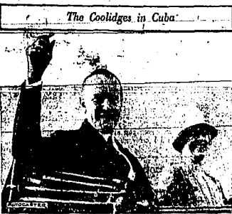
The Coolidges in Cuba.

Cash Crops vs. Livestock. It seems to be prevalent in this section that the farmer has failed due to the fact that we can do and produce very heavy yields of crops, that we are able to afford to keep much livestock of any kind. The man who entertains that idea should re-think the value of his land as a matter of fact, it has been thinking about half way; stopped thinking about where he ought to start. The history and experience of all the old established sections of the country teaches us that livestock farming on the average, has been more profitable than exclusive crop selling. Nearly all the other sections which have looked out at selling crops, were obliged to turn to livestock for better returns and in the interest of safety and stability. Wherever it is found the best and highest priced lands, the best producing and the oldest, the best livestock farming you will find the livestock industry showing its greatest development and crop selling means less to the side lines. This seems to explain the theory that livestock can not be profitably produced on high priced land and to be profitable, the farmer must resort to livestock farming as a foundation for his operations.