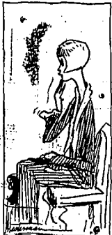
The young lady across the way... We see by the papers...