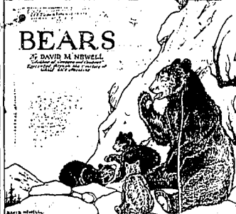
HEALTHY IS A happy family looking on the warm sun on the mountain side.