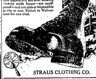
STRAUS CLOTHING CO.

SHOES WORN 1000 MILES Still Soft... Still Going Strong —because no other leather wears like Wolverine Shell Horsehide NOW you can get more for your money in work shoes than ever before! We are now showing the famous Wolverine Shoe... the most durable, comfortable leather we know—Wolverine Shell Cordovan Horsehide! Shell Horsehide wears longer because it is leather plus a reinforcing shell that stretches down and shows no wear for months. The uppers dry soft after soaking—resist acids longer—are scuff-proof—and are almost impossible to rip or tear. Switch to Wolverines for one trial.