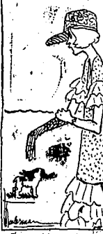
The young lady across the way was here before she was a baby and she is as big as a big tree now.