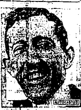
WILL H. HAYS