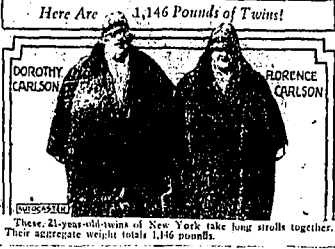
These 21-year-old twins of New York take long strolls together. Their aggregate weight totals 1,146 pounds.