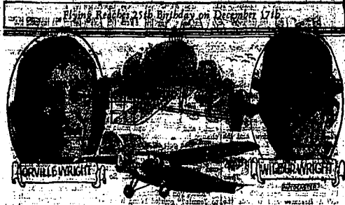
Orville Wright was the first of all men to take into the air the 25-horsepower Wright airplane. His brother, he invented the airplane. This picture shows Orville and Wilbur Wright, and the plane that they first flew. Contrast this Wright plane with the modern Fowler plane shown below, and the tremendous progress of aviation in 25 years can be seen at a glance. The original airplane of Orville Wright, which is really only a motorized glider, is on exhibition at the South Kensington, London. The first flight of Orville Wright took place at Kill Devil Hill, Kitty Hawk, N. C., on Dec. 17, 1903, when he flew 120 feet in 12 seconds.