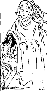
The young lady across the way will see a good many of these boys in the city but in the country where they are so dear to the eye, it is a pleasure to see them in their native haunts.