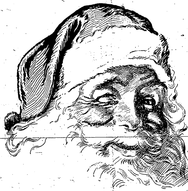
MR. S. CLAUS who is expected to visit Twinland Empire Home December 25. His arrival is awaited with expectancy and is the occasion of widespread preparation!