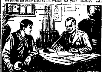
Captain MacNelly Makes his proposition to Buck Duane.

"I'm glad to see you're a regular member of his outlaw gang."