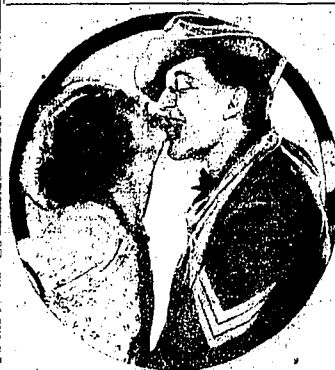
Dorothy Burgess and Edmund Lowe in "In Old Arizona" More Women Oppose Signs

Signage advertisements appearing on bill boards in Idaho, recently. Objection has been previously expressed to the bill board advertisements in general and to certain ones in particular, but the latest one—that which brought us word with indignation over certain garbled protest from organized