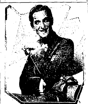
Joseph Schildkraut as Ravenel in "Show Boat" a Universal super picture which comes next Sunday to the Idaho Theatre for a limited engagement.

ARMORY ASSURED A new armory building for Company D, 116th Engineers, Iowa National Guard, at Dubuque, Ia., is practically assured with $4000 of the $7000 necessary to erect the structure.