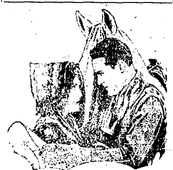
Tarzan The Wonder Horse and Ken Maynard and his leading lady, Dorothy Dwan in First National's adventure romance "The California Mail"

good, God willing. What more of Ten' worth is there, I wonder? In spite of hard knocks the future looks bright to both of us. In the years to come we expect to bring our little home as near as possible to the meaning of our fine young state—Gem of the Mountains.