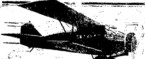
This is a Buell Airplane equipped with a single Wright J-5 Whitehead motor...