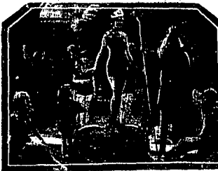
Some From 'THE COHENS AND KELLYS IN ATLANTIC CITY' A UNIVERSAL PICTURE