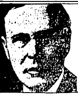
Farm Board Chairman

The story has been humming with notes about Alexander Legge, the man who is giving up his $100,000 position as President of the International Harvester company of Chicago in order to serve as chairman of the Federal Farm Board of President Hoover at a salary of $12,000 a year.