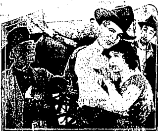
Coming to Orpheum Tuesday along with vaudeville show and Mack Sennett's all-talking comedy, "The Barber's Daughter."

However Mrs. Willebrandt's zeal for prohibition may be discounted, she can hardly be accused of having anything in common with a speak-easy.