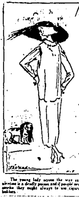
The young lady across the way says she is a really good person and she might always use Cooperatives.

"Ahem, ahem!" went Bobbie Habibi one morning after breakfast. "What's the matter?" asked Billie, his sister.