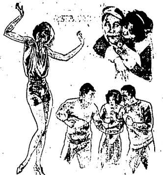
Scenes from "Sweetie" The Paramount all-talking, singing and dancing picture coming to the Idaho Theatre Next Sunday for a holiday run.

How could the crab know that it was the most harmless human in the world, just now; merely a half-drowned, senseless girl, naked as no one had ever seen her since she was a baby, as nothing had ever seen her save the sun, the sun, the sea, the jungle, and the crab?