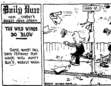
THESE WINDY FALL DAYS CELEBRATE PLAY DANCE WITH AUNT DAVE'S WEEKLY WASH.