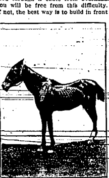
Do Not Buy Narrow-Chested Horses.