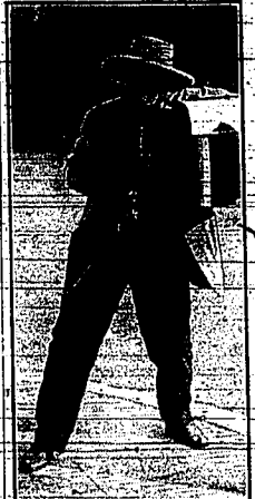
He Dropped the Jewel into the Mail Box.

active relaxed his efforts in aiding his more official brethren of the law.