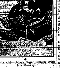
Only a Hunchback, Organ Grinder With His Monkey.

Men, while, what of the diamond from the sky? Where was it?