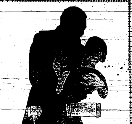
CLARA KIMBALL YOUNG IN