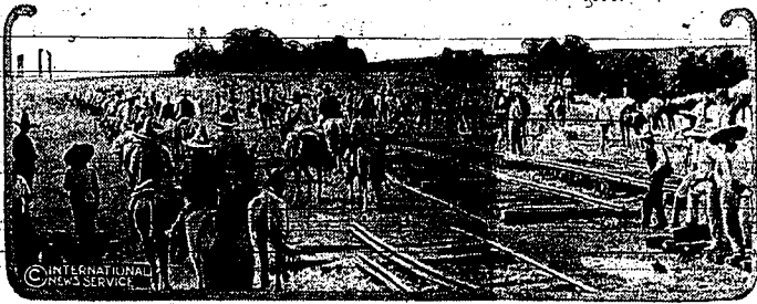
A band of Villista raiders riding along a railroad they have destroyed.