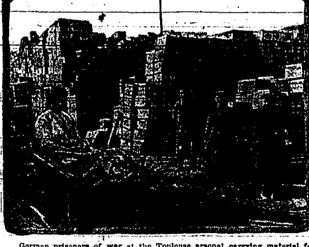
German prisoners of war at the Toulouse arsenal carrying material for the making of ammunition cases.