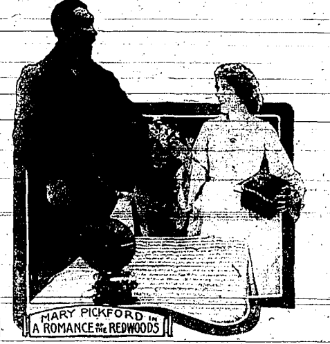
MARY PICKFORD in 'A ROMANCE IN THE REDWOODS' To soon be featured at the Idaho Theater.

In the District Court of the Fourth Judicial District of the State of Idaho, in and for Twin Falls county.