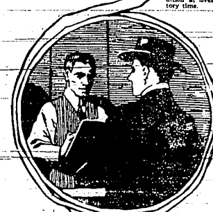
Statements and invoices proved correct.