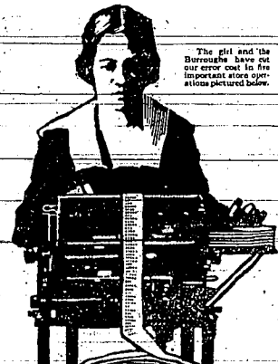
The girl and the Burroughs have set our error cost in the important store operation pictured below.

There is a Burroughs for every business, large or small. Consult your banker or telephone book for the address of the nearest of the 170 offices maintained by the Burroughs Adding Machine Company in the United States and Canada.