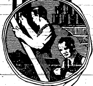
Automatic addition at inventory time.