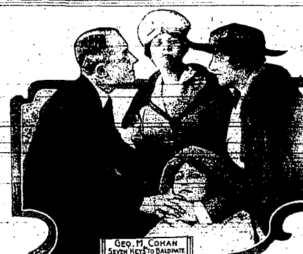
Geo. M. COHAN SIXTY-NINE TO BALDWIN (Largest Picture)