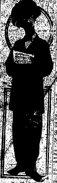
Fon LUDIN'S SLEUTHS A Pathological Murder Mystery