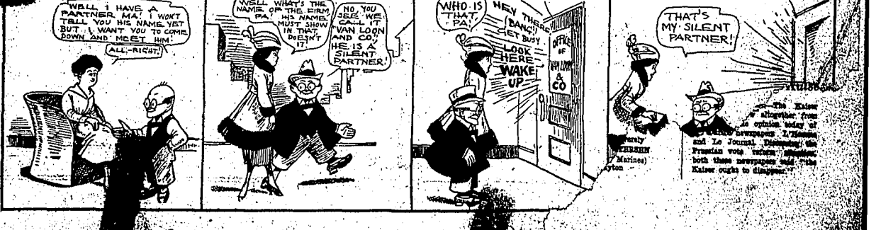
Evidently Father has some partner!