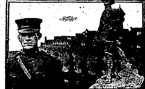
Germany has not only learned that she has no monopoly on "kultur" but is now studying at first hand a bit of the American brand each day. A cast of Rhaphaels Meyer's U. S. Marine statue stands guard at the American side of the bridge over the Rhine at Coblenz, Germany...