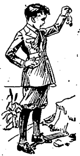
XTRAGOOD Clothes for Boys