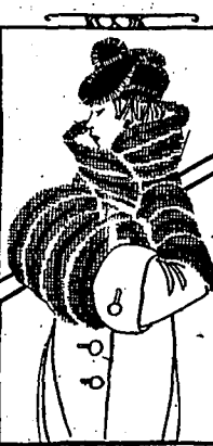
This chic fur scarf is of Kollini, smartly striped in its white and black and yellow, and matched up with a huge, cozy muff, and a furry tan costume.