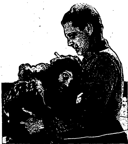
SCENE FROM VITAGRAPH'S "THE COURAGE OF MARGE O'DOONE" BY JAMES OLIVER CURWOOD A VITAGRAPH SPECIAL PRODUCTION

Oakland (Cal.) Tribune "A fighting tale. If you like strong, vigorous, red-blooded fighting stories, where blows and blood, hatreds, show themselves, together with the great wild wastes of the frozen north, grizzly bears, fierce malemutes, primitive men, and tender and beautiful women, you will like 'The Courage of Marge O'Doone.' It is a graphic tale, stirring, thrilling and unusual."