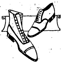
Men's English Dress Shoes

One very extra special lot of men's heavy dark brown English last shoes. All sizes. Regular price $4.00.