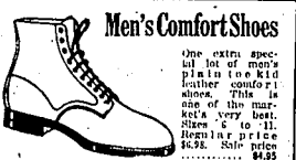
Men's Comfort Shoes

One extra special lot of men's plain toe kid leather comfort shoes. This is one of the market's very best. Sizes 6 to 11. Selling at price $6.92. Sale price $4.95.