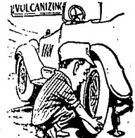
GEM STATE VULC. CO. 128 Second Ave. W.