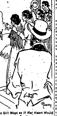
The Girl Wept as if Her Heart Would Break