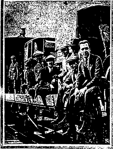
Workers of the American relief administration, aboard their relief train, entering Soviet Russia at the Latvian frontier. This is one of the first photo

to arrive here showing American relief work in famine stricken Russia.