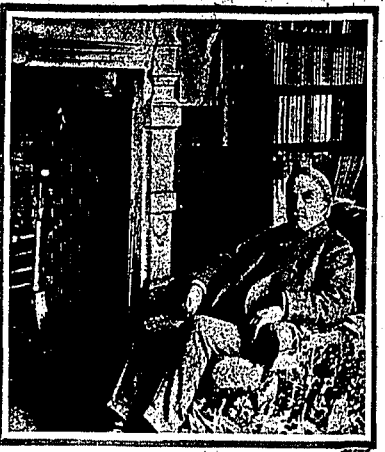
This exclusive photo of Lloyd George, fish statesman at his new home, 'The British grimo minister, is his most recent photograph. It shows the British statesman at his new home, 'The British grimo minister, is his most recent photograph. It shows the British statesman at his new home, 'The British grimo minister, is his most recent photograph.