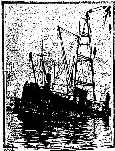
The S-48, U. S. submarine, which graph shows the undersea hunt after was down in the harbor off Bridgeport recently, being salvaged. The photo-