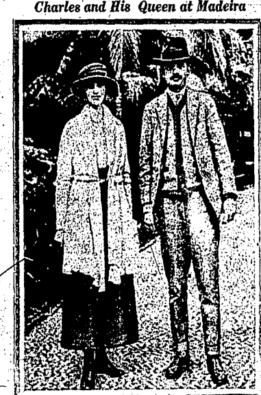
This exclusive photograph shows ex-King Charles and ex-Queen Zita of Austria in the Palm Walk of the beautiful gardens adjoining the royal residence, Villa Victoria, Madeira, where they are in exile.