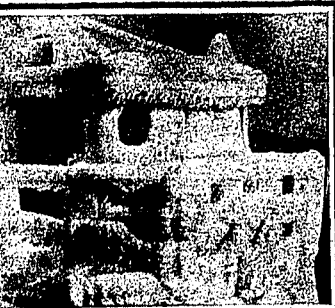
What that weather is cold in Philadelphia is furnished by this photo of the ship encountered high seas and below zero weather...