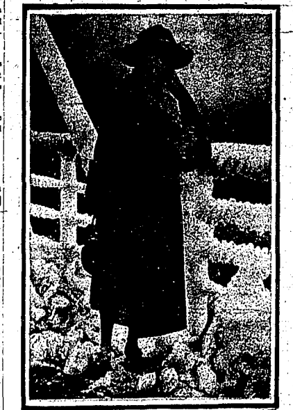
When the steamship Lorena arrived in New York she looked like she had made a trip in Polar seas. From above the line was covered with ice, dusted with a coating of snow that glittered like crystals.