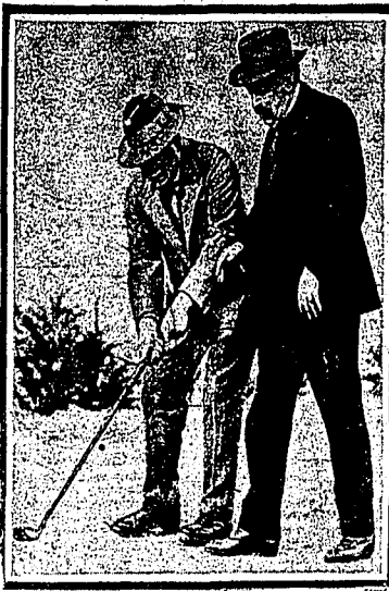
The French public demands that grave questions be treated seriously and not discussed on the golf links, says Le-Temps, of Paris. Former Minister Briand's outing with Lloyd George at Cannes, French papers agree, crystallized sentiment, when the above picture reached Paris, that led to his downfall.

Thought-Reading. This trick never fails to raise a laugh if performed before a room full of people—the more the better.