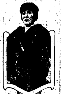
Miss Helena Rubenstein

Miss Helena Rubenstein, Parisian beautician of women, upon her arrival in New York and European markets have discovered a serum that makes women young, similarly to the monkey gland operation to which men have submitted.