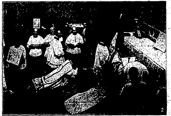
Pope Benedict celebrating mass in St. Peter's Basilica at the Vatican on December 26. The Pope was ill at the time but continued with the celebration. Shortly after he was taken seriously ill.