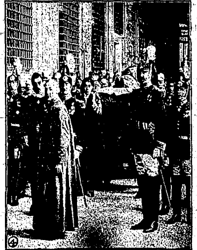
Funeral Procession Carrying the Pope to St. Peter's Basilica