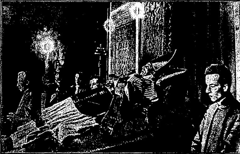
Pope Benedict Lying in State