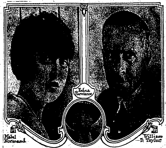
William Desmond Taylor, noted moving picture director, who was mysteriously murdered in his bungalow at Los Angeles, His assassin shot him from behind while Taylor was sitting at his desk.