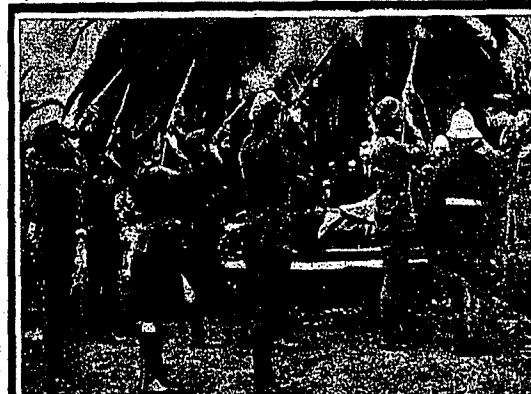
As a last tribute to William Desmond Taylor, the slain motion-picture director, Canadian ex-soldiers acted as guard of honor and fired a volley over the grave of their former comrade and officer. Thousands gathered outside of his home, in the street of Hollywood, and at his burial to pay their last respect.