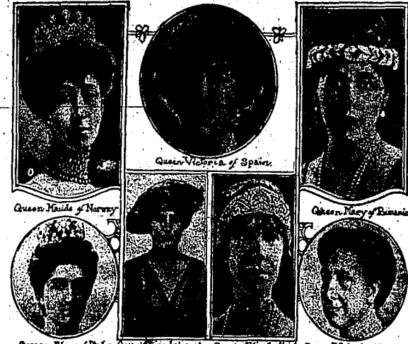
Queen Victoria of Spain, Queen Haide of Norway, Queen Elizabeth of Denmark, Queen Victoria of Sweden, Queen Mary of the United Kingdom.

Among the nobility of Europe who are making preparations to leave their courts for the wedding of Princess Mary and Viscount Lascelles in London