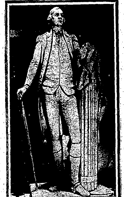
Statue of Washington to be unveiled in Trafalgar Square, London, June 30. It is a gift of the people of the State of Virginia.

England will pay tribute to the "Father of our Country" in the unveiling of the statue of George Washington, to take place in Trafalgar