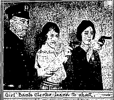
Girl Bank Clerks Train to shoot. They bring on your bandits and see if they have any luck against these girl clerks in New York's Commercial Trust company.