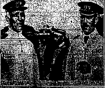
The Portuguese aviators, Naval Captains Gago Coutinho and Sacadura Cabral, photographed immediately after their arrival in Pernambuco, on the completion of their long flight across the Atlantic from Portugal to Brazil. Though flying is supposed to be the game of youths, both these intrepid naval aviators are past fifty.