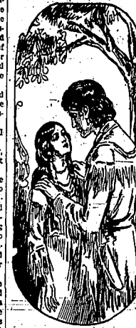
Erskine Put Both Hands on Her Shoulders and Looked Down into Her Eyes.