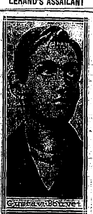
THIS is the first photograph received in France of Gustav Bover, the young French Communist who, during the celebration at Bastille Day...