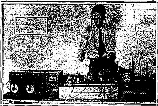
Typewriting in an aeroplane flying high in the clouds, with radio machinery reproducing the letters at a receiving station miles away, is the most recent development in wireless, as announced by the U. S. Navy department.

The receiving station is pictured with its vast array of instruments used for picking up typewritten radio messages.