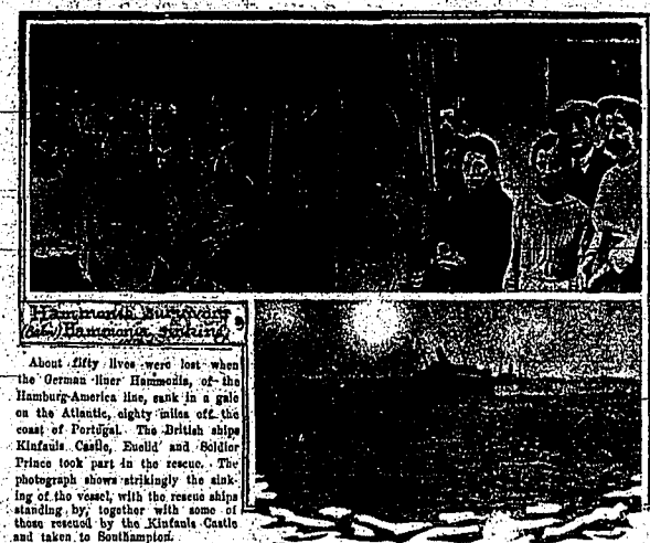
About fifty lives were lost when the German liner Hammeled, of the Hamburg-America line, sank in a gale on the Atlantic, eighty miles off the coast of Portugal. The British ship Kinfault, Castle, Bullard and Soldier Price took part in the rescue. The photograph shows strikingly the sinking of the vessel, with the rescue ships standing by, together with some of those rescued by the Kinfault, Castle and taken to Southampton.