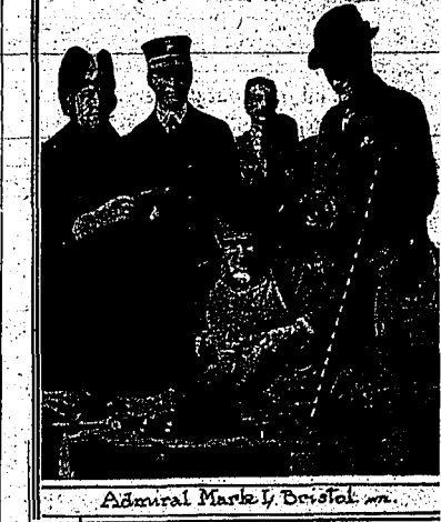
Admiral Mark L. Bristol