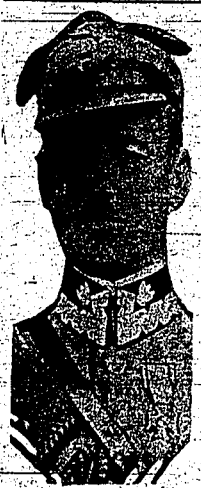
General Ludwik Skulski, Chief of the Polish Military, in London, where he was greeted by Lord Curzon, chief of the British imperial army staff.